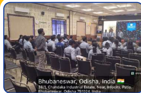
Bhubaneswar, Odisha, India 3871, Chandaka Industrial Estate, Near, Infocity, Patia, Bhubaneswar, Odisha 751024, India